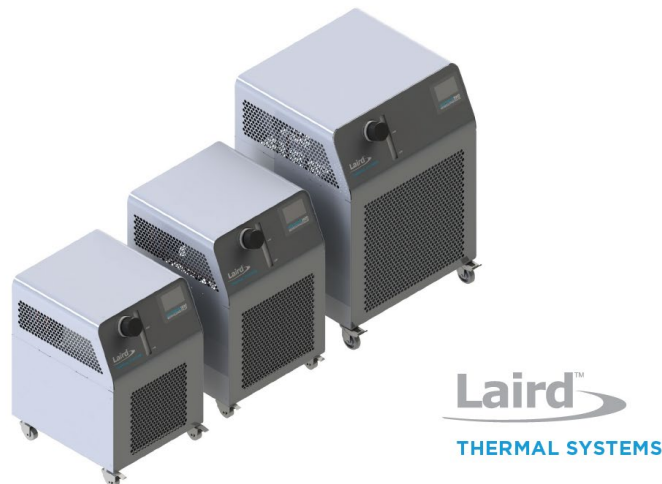
The Nextreme Recirculating Chiller Platform is available in three different versions, 1200W, 2400 W and 5000 W.

The Nextreme Chiller Series is available in three standard cooling capacities including 1200 W, 2400 W and 5000 W models. All Nextreme Chiller models are configurable in order to meet specific application requirements.