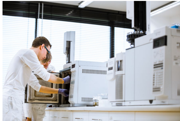
Lab instrumentation tools such as electron microscopes require an advanced thermal management solution for precise temperature control of electronics and samples.

Compressor-based chillers with integrated temperature control offers an advanced thermal management solution that keep sensitive electronics and samples at the optimum temperature for operation and examination respectively. However, because of new industry restrictions on hazardous refrigerants central in traditional chiller technology, electron microscope manufacturers now require a more environmentally friendly, efficient and maintenance-free chiller solution. The eco-friendly Nextreme Chiller quietly cools temperature sensitive components below ambient temperature to ensure optimum image quality.