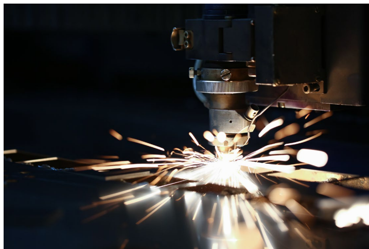
Thermoelectric coolers provide spot cooling for high performance industrial lasers.

A focused laser beam can generate a significant amount of heat. High-power industrial lasers can generate in excess of 10,000 Watts during operation of thick metals. Temperature control of the sensitive optics inside the laser needs to be maintained to achieve peak performance. Changes in temperature can distort the laser wavelength as it passes thru the optics, causing inefficiencies that can result in poor welds or sputtering. Compressor-based refrigeration systems have long been used to cool laser systems while thermoelectric-based chillers or coolers offer spot cooling for low power lasers and optical components. This application note will focus on how thermoelectric coolers can be used for spot cooling of industrial laser optics.